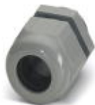
Cable gland, Cable gland material: Polyamide 6, External cable diameter 11 mm ... 17 mm, Shielding: No, Connecting thread: M25, Color: silver grey

Cable gland - G-INS-M25-M68N-PNES-GY - 1411126