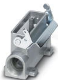
HEAVYCON box mounting base D25, with single locking latch, height 57 mm, with supports 1x M25

Please be informed that the data shown in this PDF Document is generated from our Online Catalog. Please find the complete data in the user's documentation. Our General Terms of Use for Downloads are valid ( http://phoenixcontact.com/download )