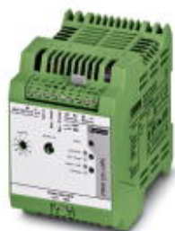
Uninterruptible power supply with integrated power supply unit, 4 A, in combination with MINI-BAT/12/DC 1.6 Ah or 2.6 Ah

Please be informed that the data shown in this PDF Document is generated from our Online Catalog. Please find the complete data in the user's documentation. Our General Terms of Use for Downloads are valid ( http://phoenixcontact.com/download )