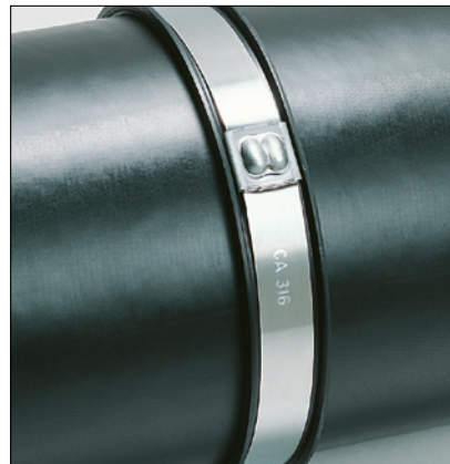
Cable tie MBTXH with LFPC Protective Channel.

The fire protection properties of the material relate to the test performed on defined test samples. This is a test under laboratory conditions and not directly transferable to the product made from this material.