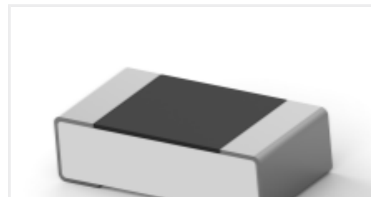
TE Part #2-2176372-2 RQ 0603 82K5 0.1% 10PPM 5K RL