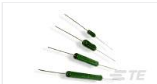
TE Part #1623773-2 C10 150R 5% (LOOSE)