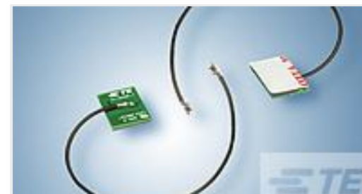
TE Part #2118326-1 Single Band WiFi, 5GHz, PCB, Chassis Mt.