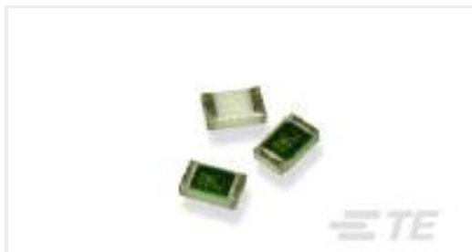
TE Part #7-1879223-7 CPF 0603 1K65 0.1% 25PPM 1K RL