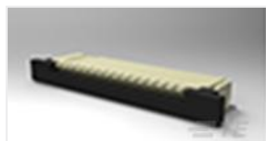
TE Part #3-84953-0 1MM FPC HORZ.TOP CONT.ASSY 30P