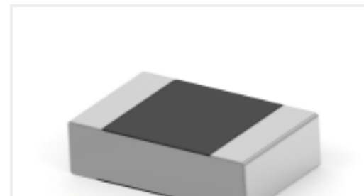
TE Part #2176238-4 CPF A 0805 15R 0.1% 25PPM 5K RL