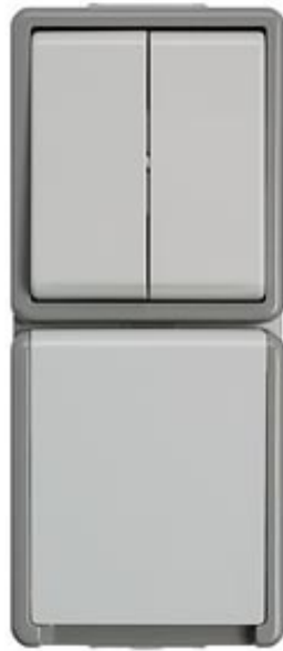
DELTA FLAT IP44, SM DARK GRAY/LIGHT GRAY 2-CIRCUIT SWITCH, 10A 250 SCHUKO OUTLET W.HINGED LID 10/16A 250V, 66X151MM