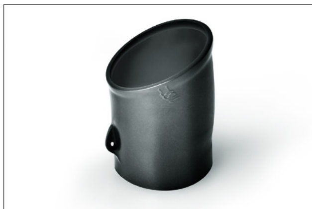
Preformato 1152-4 espanso (come fornito).

Per informazioni in merito al Materiale / Adesivo vedi pag. 200.