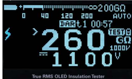
Figure 5. Adjustable insulation test voltage up to 1.1 kV

The adjustable insulation test voltage from 10 V to 1.1 kV in 1 V steps on selected two models 1 allows you to set precise test voltages catered to unique test application requirements. These typical applications are commercial avionics testing, military communications system testing and production line testing. The standard test voltages from 50 V to 1 kV is also available for selected models 2 .