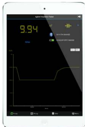
Figure 3. Data logging interface on Agilent Insulation Tester Application