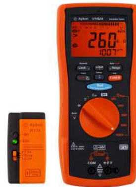
Figure 4. U1117A IR-to-Bluetooth Adapter enables wireless remote testings with the U1450A/U1460A series