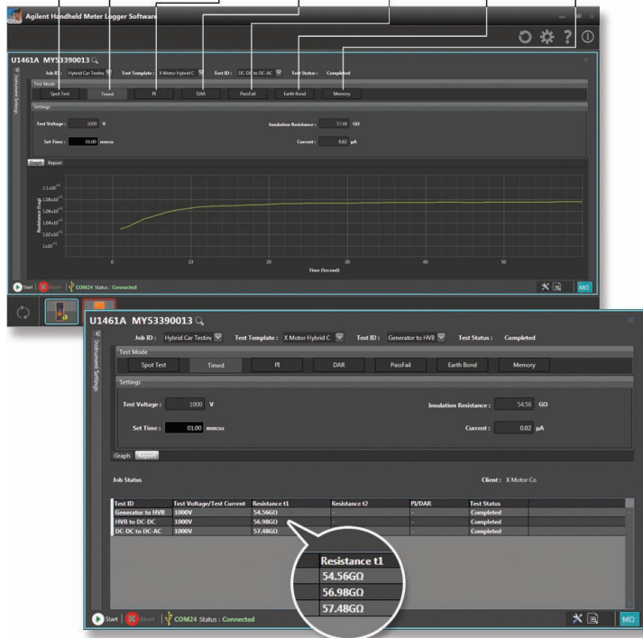
Job Status Reporting View

Spot Test Timed Test PI Test DAR Test Pass Fail Earth Bond Memory