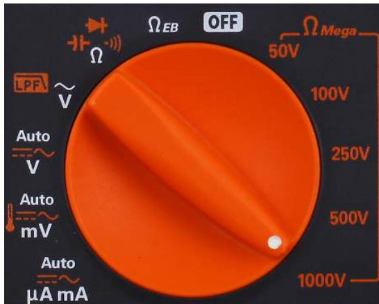
Figure 6. Insulation resistance tester with full featured DMM