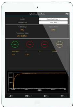
Figure 2. Perform remote testing with Agilent InsulationTester Application