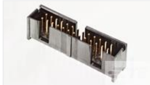
TE Part #5103308-1 A/L LOW PRO HDR 10P VERT BLACK