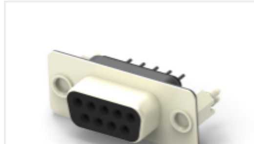
TE Part #2301838-1 AMPL REC HD20, VERT, 9P, B/L,4-40 INS