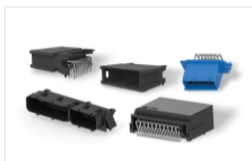
Automotive Signal & Power Headers(3)