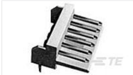
TE Part #171826-3 3P POST HEADER ASSY EI