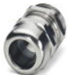
Cable gland, Cable gland material: Nickel-plated brass, External cable diameter 11 mm ... 17 mm, Shielding: No, Connecting thread: M25, Color: silver

Cable gland - G-INS-M25-M68N-NNES-S - 1411165