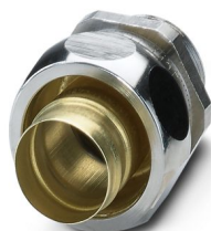
Cable gland made from brass with metric thread, IP65 protection

Please be informed that the data shown in this PDF document is generated from our online catalog. Please find the complete data in the user documentation. Our general terms of use for downloads are valid.