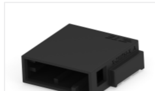
TE Part #2311714-1 6POS,TAB0.5X0.4,HDR ASSY,90DEG, COD A