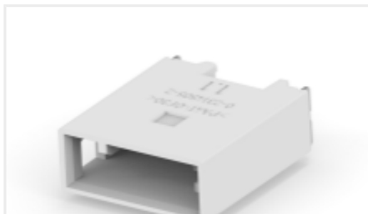
TE Part #2314505-2 5POS,TAB0.5X0.4,HDR ASSY,180DEG, COD B