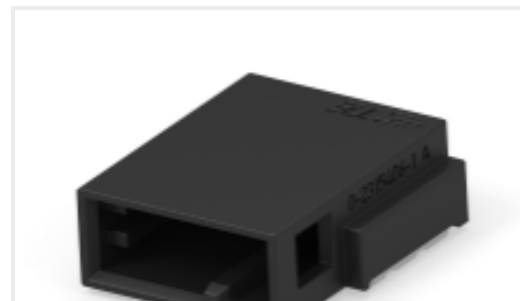
TE Part #2315405-1 4POS,TAB0.5X0.4,HDR ASSY,90DEG, COD A