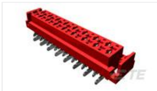
TE Part #2-338069-0 MICRO-MATCH SMD FTE