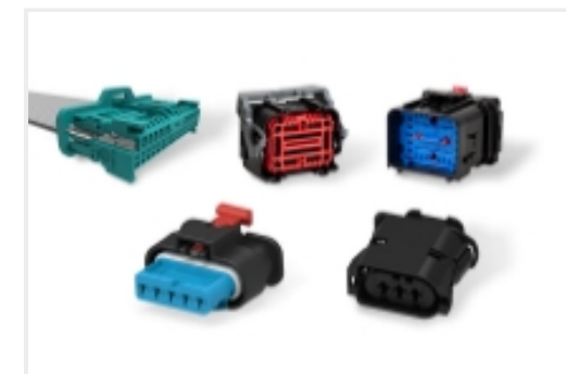
Automotive Signal &amp; Power Connector Housings(118)