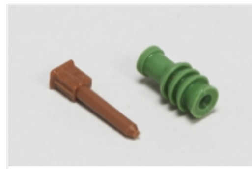
Automotive Seals &amp; Cavity Plugs(1)