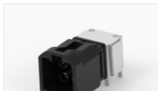
TE Part #2321775-1 4P,MATE-AX,HDR ASSY,90DEG,COD A