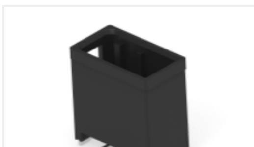
TE Part #1-2395006-1 12POS,TAB0.5X0.4,HDR ASSY, 180DEG,COD A