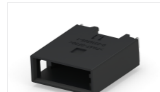
TE Part #2314505-1 5POS,TAB0.5X0.4,HDR ASSY,180DEG, COD A