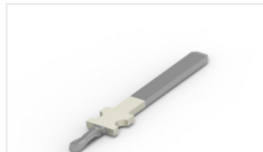
TE Part #1394353-2 FLACHSTE A-P 1,5