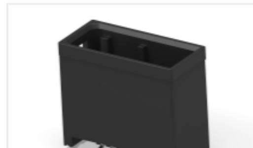
TE Part #2317531-1 2X8POS,NANOMQS,HDR ASSY, 180DEG,SMD,COD A