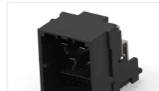
TE Part #2418383-1 28POS,HYBRID,HDR ASSY,90DEG, SLDR,COD 1