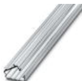
Cover profile, length: 300 mm, color: transparent