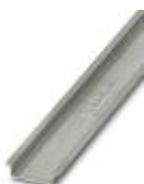
DIN rail, unperforated, Standard profile, width: 35 mm, height: 7.5 mm, acc. to EN 60715, material: Steel, galvanized, passivated with a thick layer, length: 2000 mm, color: silver

DIN rail, unperforated - NS 35/ 7,5 UNPERF 2000MM - 0801681