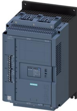
SIRIUS soft starter 200-600 V 63 A, 24 V AC/DC Screw terminals Analog output