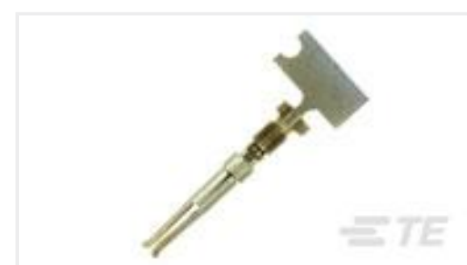
TE Part #66504-9 SOCKET CONTACT, 20 DF