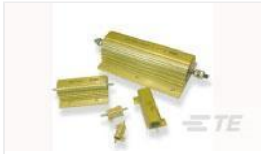
TE Part #7-1625984-4 HSA50 5R6 5%