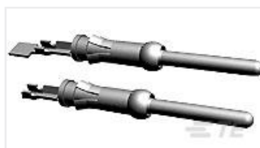
TE Part #1-66103-7 III+ PIN,24-20, 30AU/SN,SMPACK