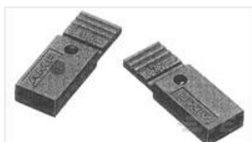
TE Part #2-881545-2 AMP SHUNT LOW PROFI