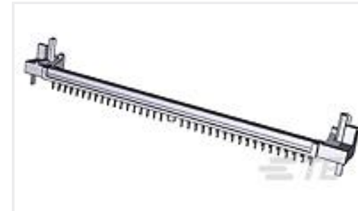
TE Part #5822097-3 72 ME .050 L/P AU M/L PB-FREE