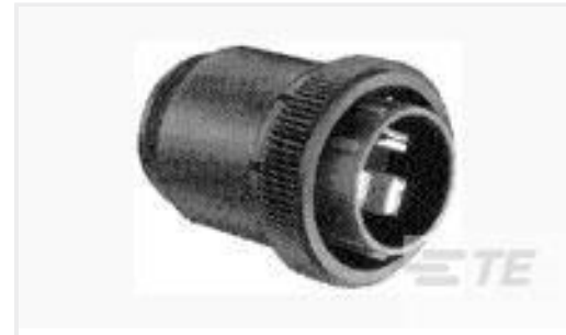
TE Part #206226-1 CPC PLUG ASSEMBLY SIZE 23-7