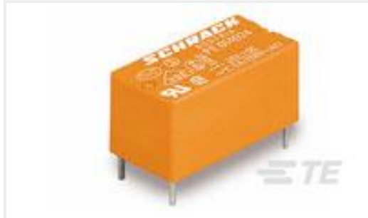
TE Part #1-1393219-0 PE014024