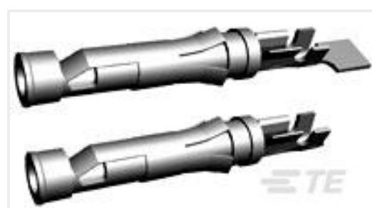
TE Part #1-66105-8 III+ SKT,24-20,30AU/FL,SMPACK