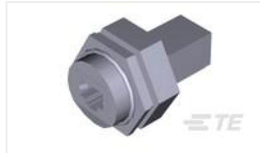
TE Part #1546413-3 ETHERNET RJ-45 BLKHd PASSTHRU