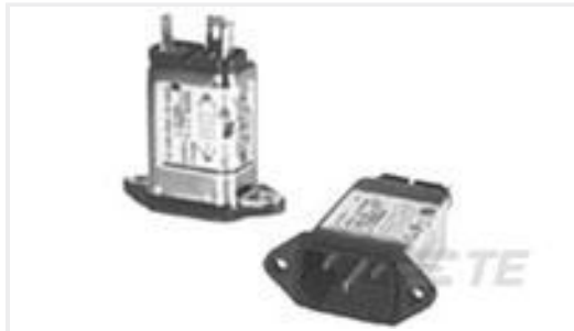
TE Part #6609002-1 1EAH1=F7530E S0