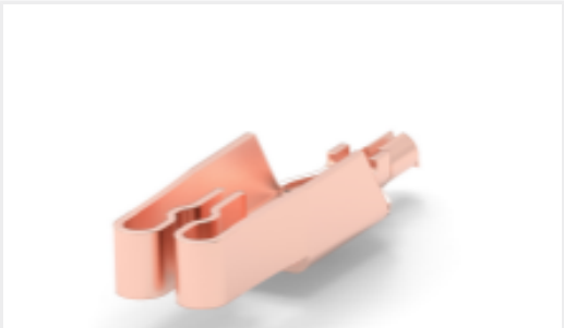
TE Part #5-531355-3 HIGH CURRENT LOOSE PIECE