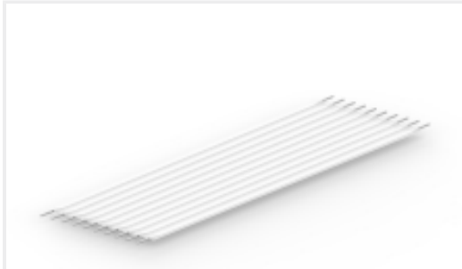
TE Part #5-1437141-2 FSN-22.5A-5=NOMEX FS STD