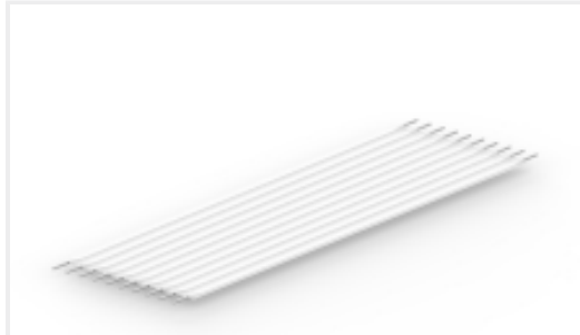
TE Part #5-1447185-5 FSN-21A-9A=JUMPER NOMEX