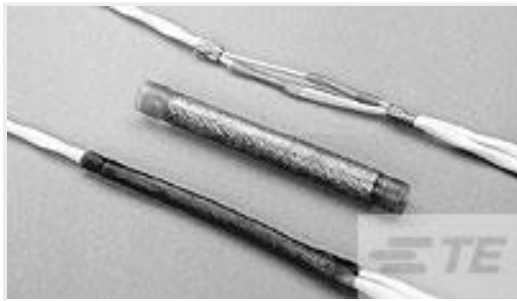
TE Part #987551-000 D-150-0134