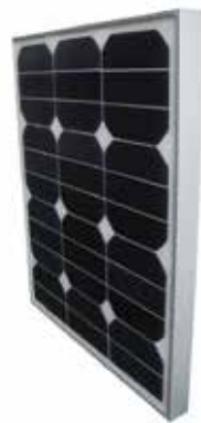
Sun Peak SPR 30