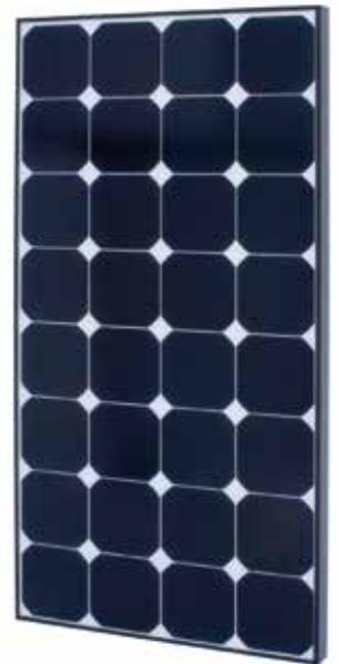
Sun Peak SPR 100