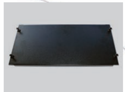
19" Blanking panel