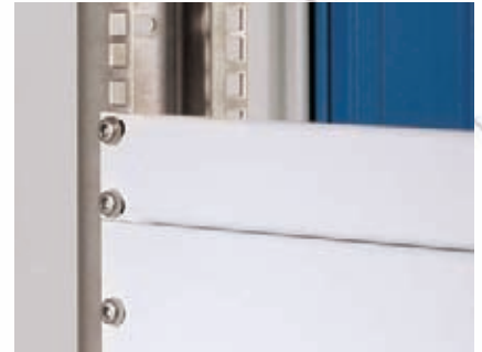
19" Front panel