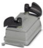
HEAVYCON ADVANCE IP65 protective cover B6, with bayonet locking, with retaining cord, diameter of retaining cord eyelet 3 mm

Protective covers - HC-B 6-TMB-SD-IP65 - 1690930