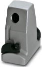
HEAVYCON ADVANCE EMV sleeve housing B6, with bayonet locking, height 100 mm, with 1xM25 thread, lateral cable outlet

Please be informed that the data shown in this PDF Document is generated from our Online Catalog. Please find the complete data in the user's documentation. Our General Terms of Use for Downloads are valid ( http://phoenixcontact.com/download )