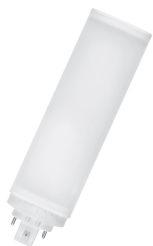
146262 DULUX T/E LED GX24q-3 HF & AC 16W (32W) 830