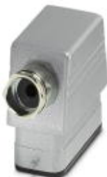
Sleeve housing, for single locking latch, height 66 mm, with screw connection, 1x Pg16, lateral cable entry

Please be informed that the data shown in this PDF Document is generated from our Online Catalog. Please find the complete data in the user's documentation. Our General Terms of Use for Downloads are valid ( http://phoenixcontact.com/download )