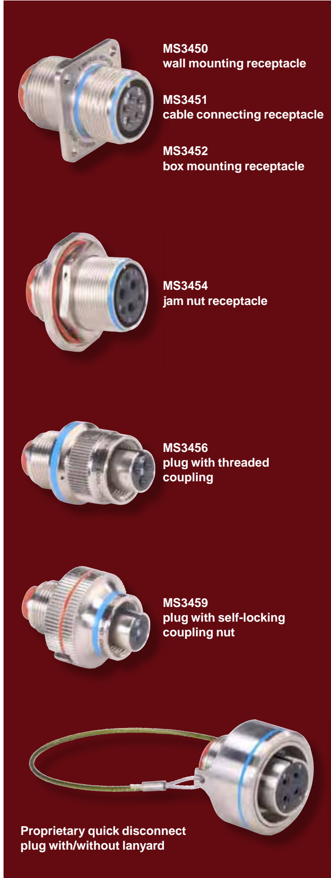
MS3450 wall mounting receptacle