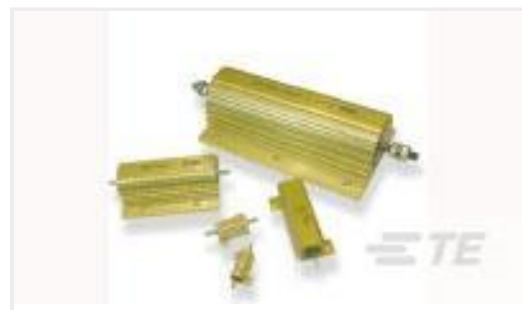
TE Part #3-1625999-4 HSC100 470R 5%