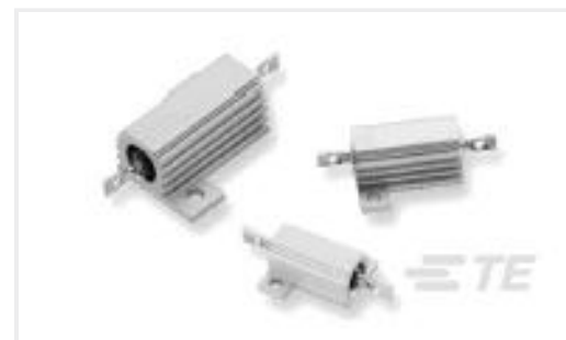
TE Part #1-1879075-3 THS25 1R0 5%