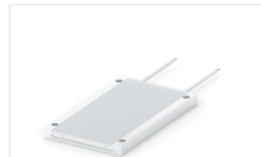
TE Part #1-2176247-7 TJT 150W 470R 5%