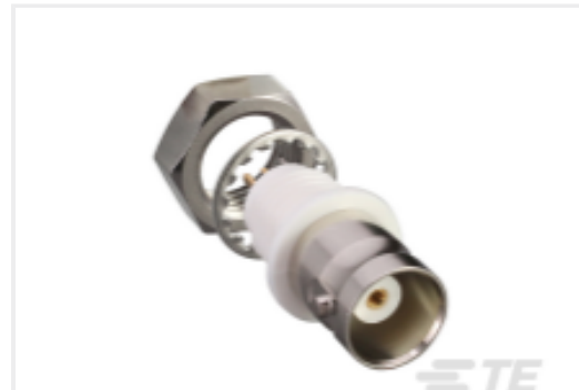
TE Part #CONBNC004 BNC Jack 50 Ohm Panel Mount