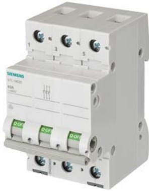
off switch 32A 3-pole