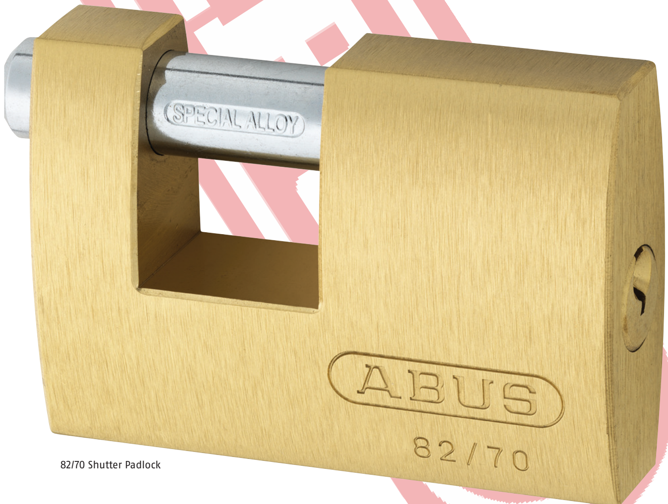
82/70 Shutter Padlock

"NanoProtect" Chrome Plating Helping to make rusty shackles a thing of the past