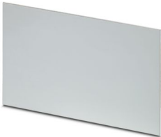
Press-drawn section housings, Basic profile front plate, width: 101.8 mm, length: 235 mm, depth: 2 mm, recommended for UM-ALU 4-..COVER AL lateral elements

Please be informed that the data shown in this PDF document is generated from our online catalog. Please find the complete data in the user documentation. Our general terms of use for downloads are valid.