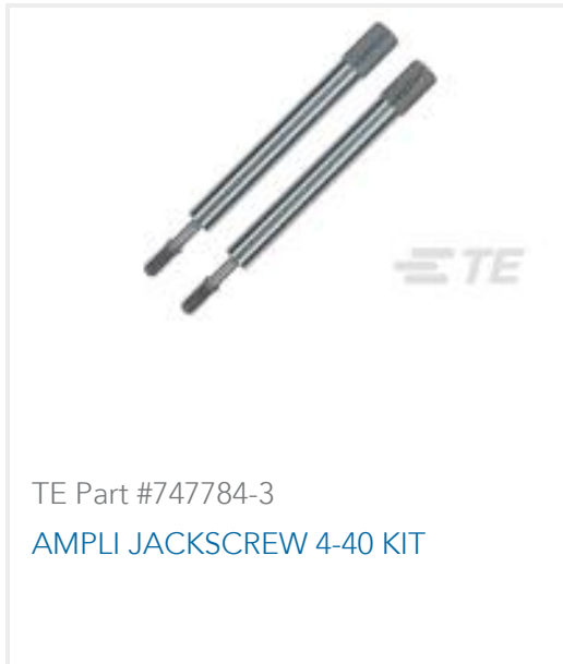
TE Part #747784-3 AMPLI JACKSCREW 4-40 KIT