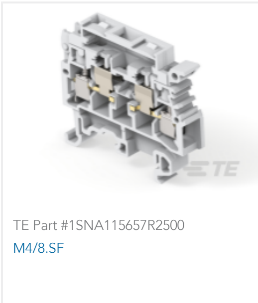
TE Part #1SNA115657R2500 M4/8.SF