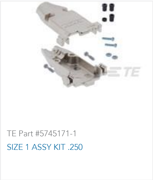
TE Part #5745171-1 SIZE 1 ASSY KIT .250