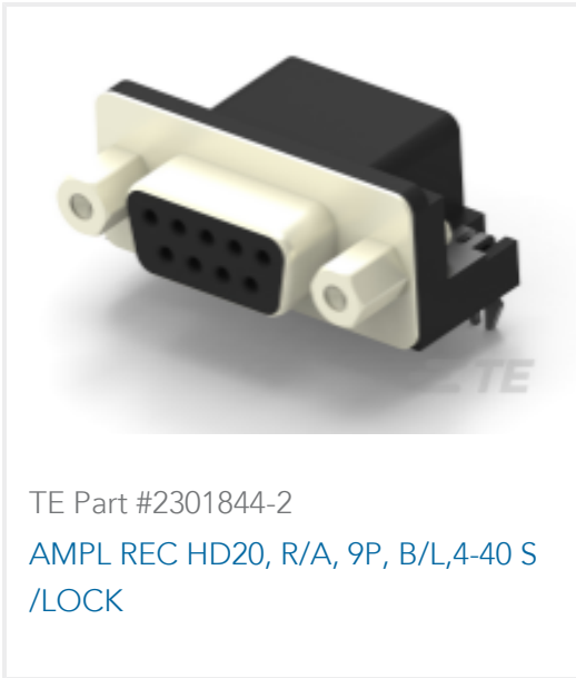
TE Part #2301844-2 AMPL REC HD20, R/A, 9P, B/L,4-40 S /LOCK