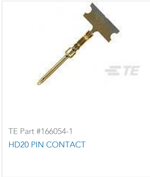
TE Part #166054-1 HD20 PIN CONTACT