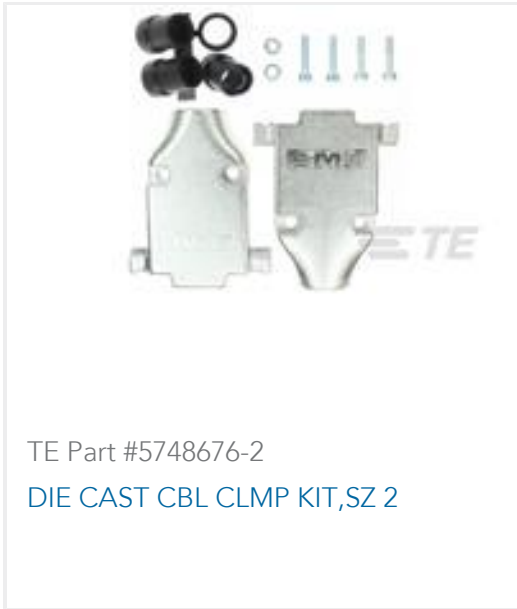
TE Part #5748676-2 DIE CAST CBL CLMP KIT,SZ 2