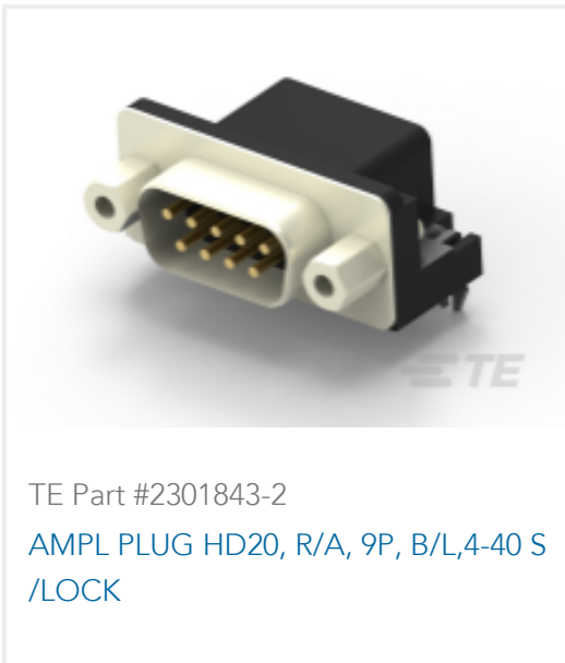
TE Part #2301843-2 AMPL PLUG HD20, R/A, 9P, B/L,4-40 S /LOCK