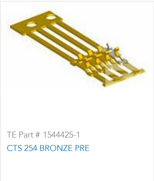
TE Part # 1544425-1 CTS 254 BRONZE PRE