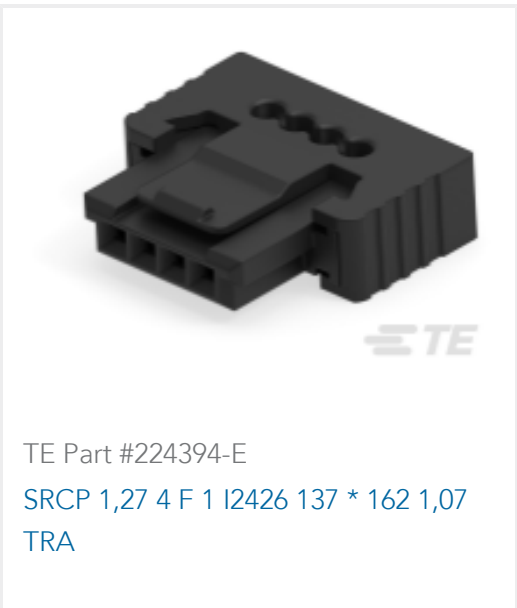
TE Part #224394-E SRCP 1,27 4 F 1 I2426 137 * 162 1,07 TRA