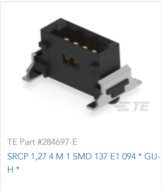
TE Part #284697-E SRCP 1,27 4 M 1 SMD 137 E1 094 * GU- H *