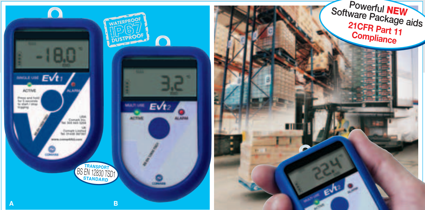
A: EVt1 single-use transport logger. B: EVt2 multi-use transport and general applications logger