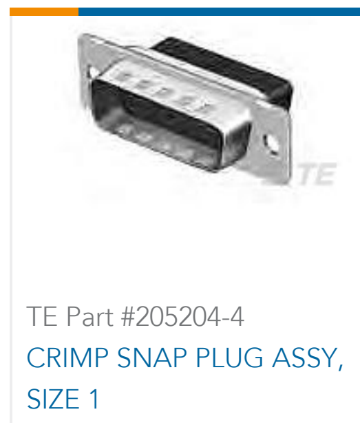
TE Part #205204-4 CRIMP SNAP PLUG ASSY, SIZE 1