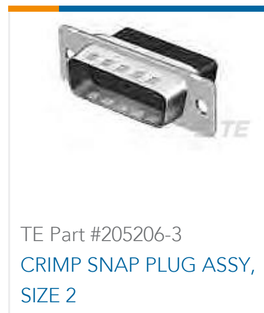
TE Part #205206-3 CRIMP SNAP PLUG ASSY, SIZE 2