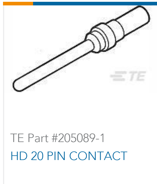
TE Part #205089-1 HD 20 PIN CONTACT