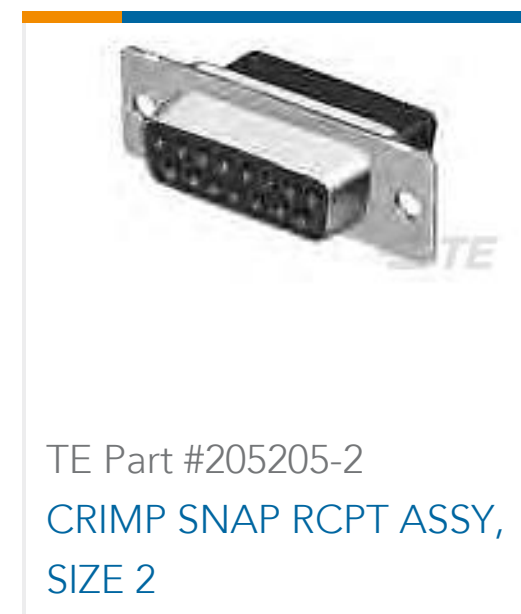
TE Part #205205-2 CRIMP SNAP RCPT ASSY, SIZE 2