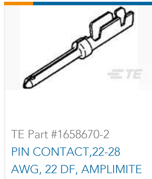
TE Part #1658670-2 PIN CONTACT, 22-28 AWG, 22 DF, AMPLIMITE