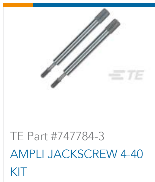
TE Part #747784-3 AMPLI JACKSCREW 4-40 KIT