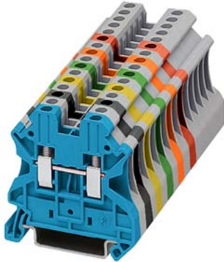
Terminal, screw terminal, through-type terminal, 2.5 mm 2 , orange