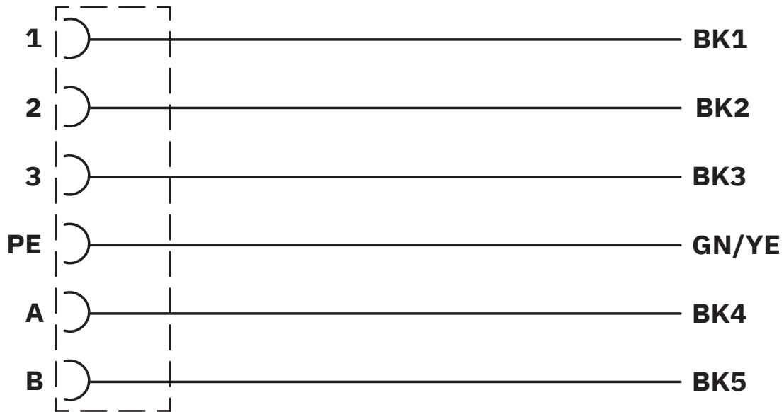
Contact assignment of the M12 socket