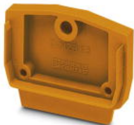
End cover, length: 32 mm, width: 4 mm, height: 22 mm, color: orange

Please be informed that the data shown in this PDF Document is generated from our Online Catalog. Please find the complete data in the user's documentation. Our General Terms of Use for Downloads are valid ( http://phoenixcontact.com/download )