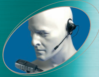
■ EA19/750 ▲ EA19/950