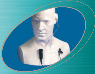
■ EA15/750 ▲ EA15/950