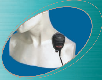
■ CMP750 ▲ CMP950