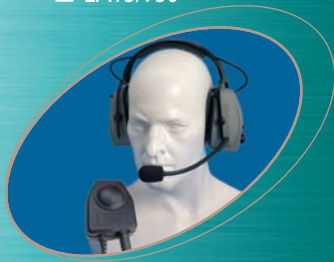
■ CHP750D ▲ CHP950D