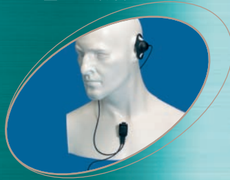
■ EA12/750 ▲ EA12/950