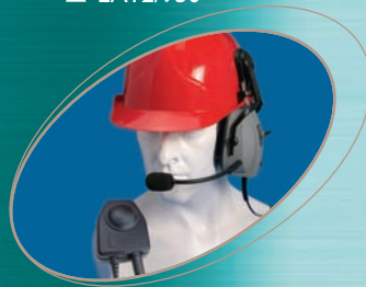
■ CHP750HS ▲ CHP950HS