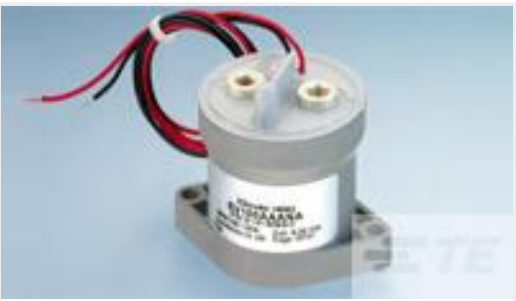
TE Part #5-1618398-0 EV100AAANA=CONTACTOR, SPST-NO 9-36Vdc