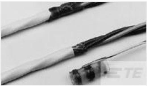
TE Part #758539-000 SO63-2-00