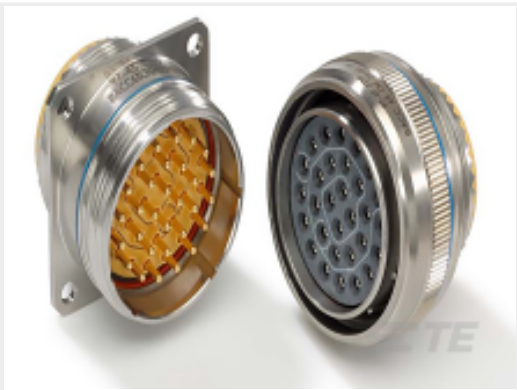
TE Part #ZPF0000000000008632 983-6S 16-24 SN