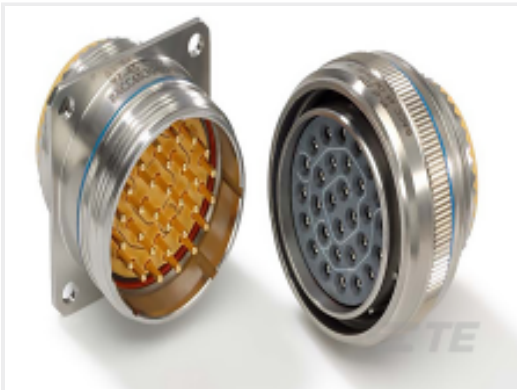
TE Part #ZPF0000000000008591 983-6S 12-12 SN