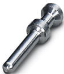
Turned 2.5 crimp contact, individual CuNi male contact, core cross section 0.5 mm 2 , uncoated

Please be informed that the data shown in this PDF Document is generated from our Online Catalog. Please find the complete data in the user's documentation. Our General Terms of Use for Downloads are valid ( http://phoenixcontact.com/download )