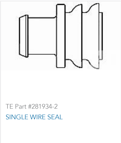
TE Part #281934-2 SINGLE WIRE SEAL