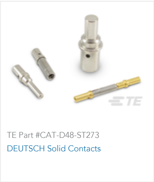
TE Part #CAT-D48-ST273 DEUTSCH Solid Contacts