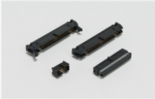
Ribbon Cable Connectors(523)