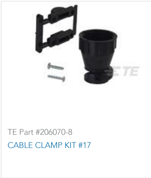
TE Part #206070-8 CABLE CLAMP KIT #17