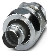
Cable gland made from brass with Pg thread, IP40 protection

Please be informed that the data shown in this PDF document is generated from our online catalog. Please find the complete data in the user documentation. Our general terms of use for downloads are valid.