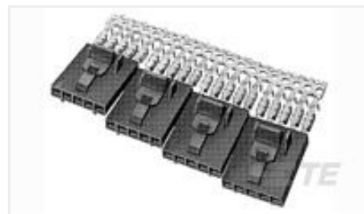
TE Part # 103957-9 2X10 MTE RCPT SR LATCH .100CL