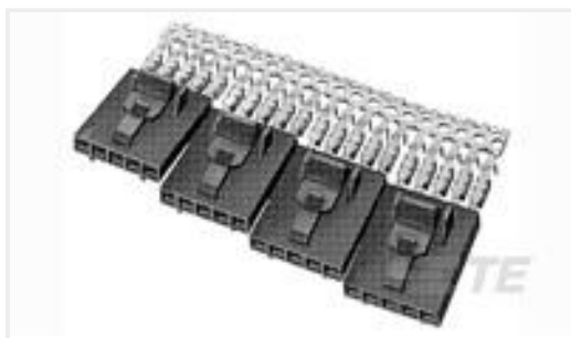
TE Part # 103960-9 2X10 MTE RCPT SR LATCH .100CL