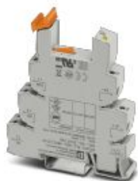
14 mm PLC basic terminal block for high continuous currents with screw connection, without relay or solid-state relay, for mounting on DIN rail NS 35/7,5, 1 PDT, input voltage 48 V DC

Please be informed that the data shown in this PDF Document is generated from our Online Catalog. Please find the complete data in the user's documentation. Our General Terms of Use for Downloads are valid ( http://phoenixcontact.com/download )