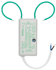
146219 TOPO Little Transformer 12V AC 0-50W / LED 0-20W DIM