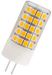
145103 LED GY6.35 DIM 12V 4.5W (43W) 520lm 827 Clear