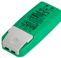
145683 TOPO Mini Transformer 12V AC 0-50W / LED 0-30W DIM