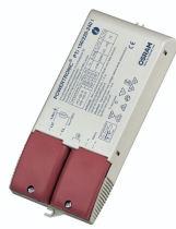
92200236499 POWERTRONIC INTELLIGENT PTi I 150/220...240 I