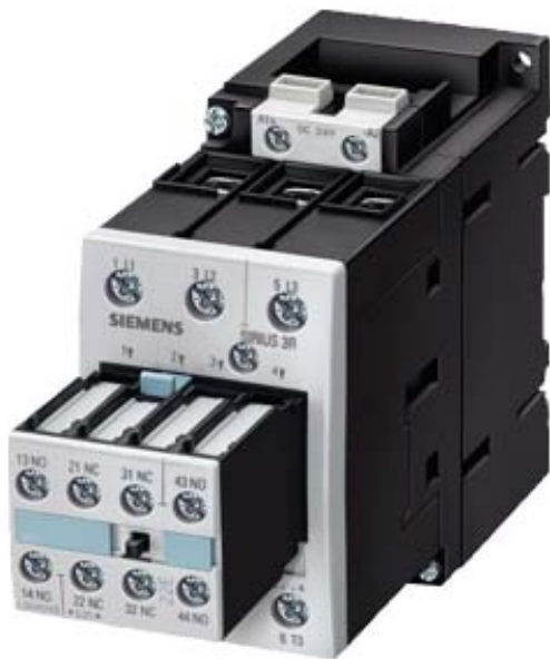
CONTACTOR, AC-3 22 KW/400 V, DC 24 V, 3-POLE, 2 NO + 2 NC, SIZE S2, SCREW CONNECTION