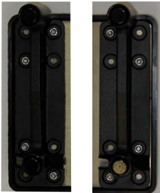
Fig. 1 Right Side Left Side No trackerball Both types