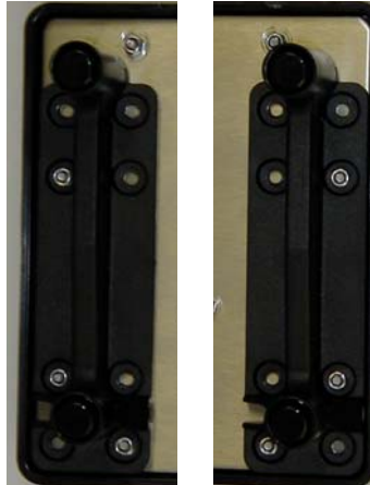
Fig. 2 Right Side & Left Side