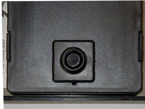
Fig. 4 Bumpstop Position on pod lid