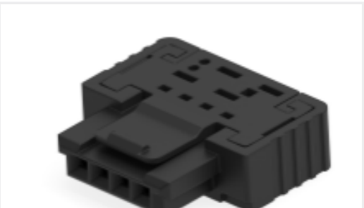
TE Part #394897-E SRCA 1,27 4 F 1 IDC22 137 E1 094 1,27 TR