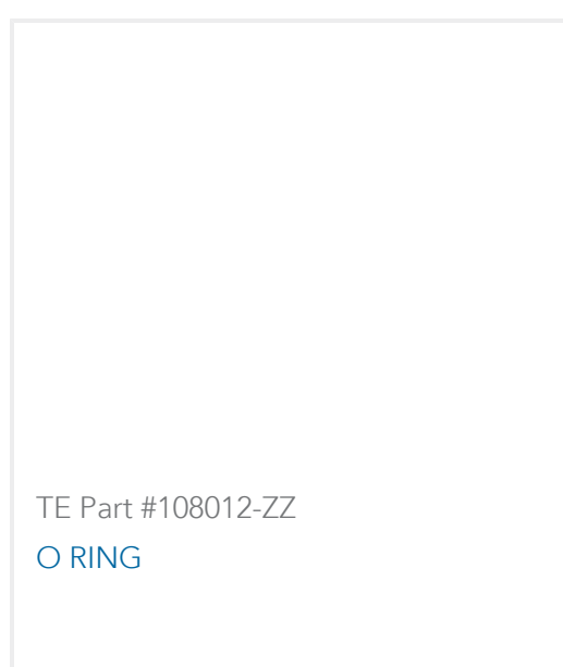
TE Part #108012-ZZ O RING