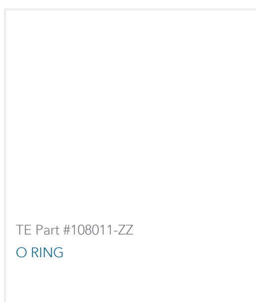
TE Part #108011-ZZ O RING