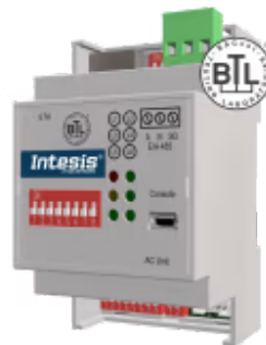
Panasonic to BACnet/IP & MS/TP - 1 indoor unit

The Panasonic-BACnet interface allows full bidirectional communication between Panasonic Etherea Air Conditioner units and BACnet/IP or MS/TP networks. The interface enables BACnet communication via polling or subscription requests (COV), making the indoor unit available through independent BACnet objects.