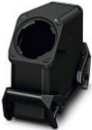
HEAVYCON EVO coupling housing, plastic, with bayonet flange for EVO screw connection, B24, with double locking latch, height: 90 mm, without EVO screw connection

Please be informed that the data shown in this PDF Document is generated from our Online Catalog. Please find the complete data in the user's documentation. Our General Terms of Use for Downloads are valid ( http://phoenixcontact.com/download )