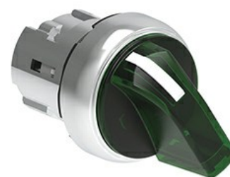
Illuminated selector switch actuator - 3 position LPSSL13