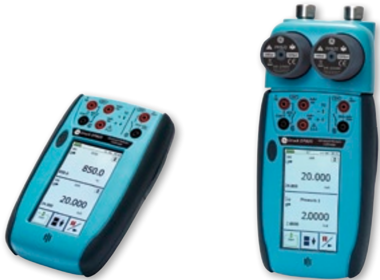
Measure and source mA, mV, V, ohms, frequency, RTD's and thermocouples.

The simple yet sophisticated design and concept combines, for the first time, an advanced electrical calibrator with state-of-the-art pressure measurement and generation, so that there is no longer any need to compromise one measurement capability in favour of another.