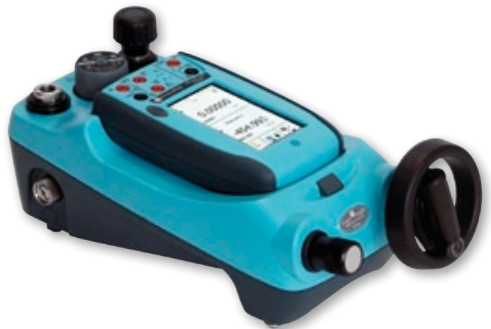
Re-rangeable pressure measurement and generation from 25 mbar (10 inH 2 O) to 1000 bar (15000 psi)