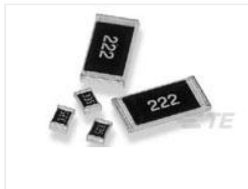
TE Part #2176186-1 CRGH1206 1% 120R 0.5W