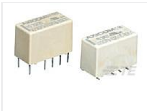
TE Part #4-1393789-3 V23079D2001B301