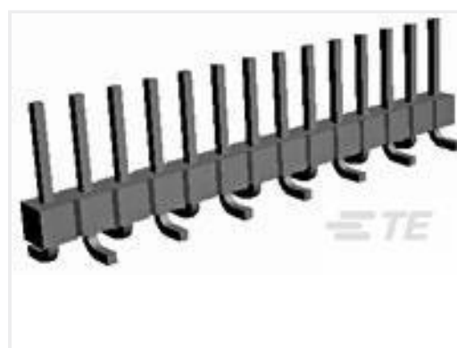
TE Part #5-146132-2 04 MODII HDR SR SFMNT B/A .100