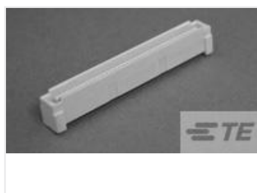
TE Part #6123001-3 0.8FH, P08H.5, 080, 30/Sn, TR, SC