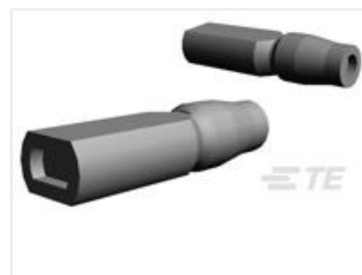
TE Part #170823-3 250 FASTON SLEEVE, REC., TRANSPARENT