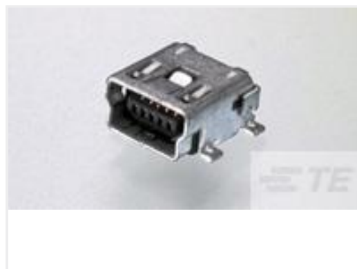
TE Part #1734035-2 MINI USB, TYPE B, R/A, SMT