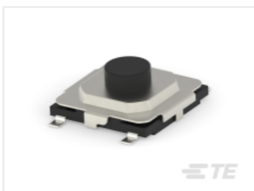
TE Part #2337238-3 TACT MINI GW 5.2X5.2X2 160GF