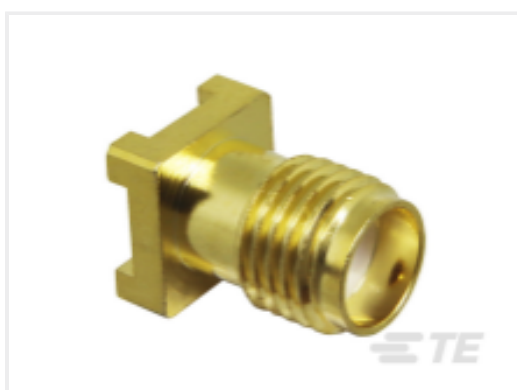
TE Part #CONSMA001-SMD-G SMA Jack 50 Ohm PCB Surface Mount