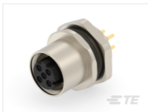
TE Part #T4143512041-000 M12, FRONT MOUNTING, FEMALE, D CODE, 4P