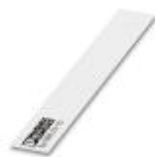
Marker for terminal blocks, Card, white, unlabeled, can be labeled with: CMS-P1-PLOTTER, perforated, mounting type: snap into tall marker groove, snap into flat marker groove, for terminal block width: 7.5 mm, lettering field size: 15 x 7.5 mm

Marker for terminal blocks - SBS 2,5/7,5 - 1007604